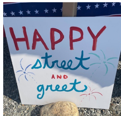
PICS FROM OUR FIRST STREET AND GREET!